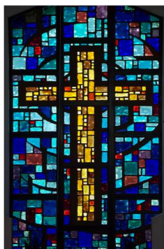
By the Cross We Care One Person at a Time