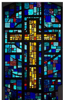
By the Cross We Care One Person at a Time