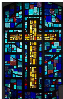
By the Cross We Care One Person at a Time