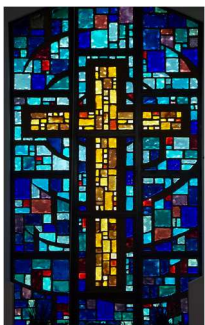
By the Cross We Care One Person at a Time