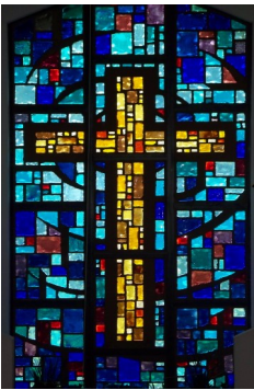
By the Cross We Care One Person at a Time