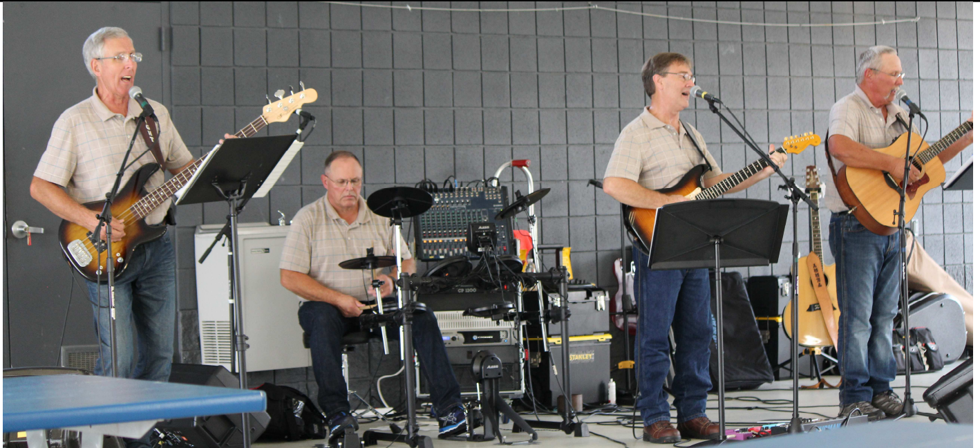
Junction Five entertaining at the church picnic.