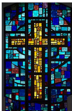
By the Cross We Care One Person at a Time