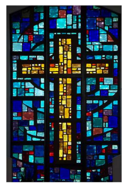
By the Cross We Care One Person at a Time