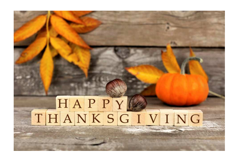
CHURCH OFFICES CLOSED NOVEMBER 25 AND 26 No service Wednesday, Nov. 24