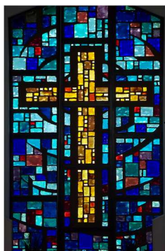
By the Cross We Care One Person at a Time