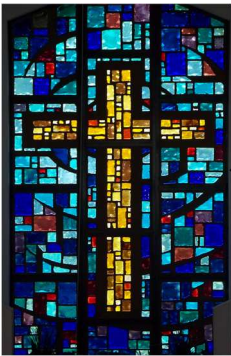
By the Cross We Care One Person at a Time