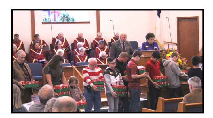
2019 SHOEBOX DEDICATION

After sharing the story of the Good Samaritan, Jesus said "go and do likewise." That is the mission of Samaritan's Purse—to follow the example of Christ by helping those in need and proclaiming the hope of the Gospel.